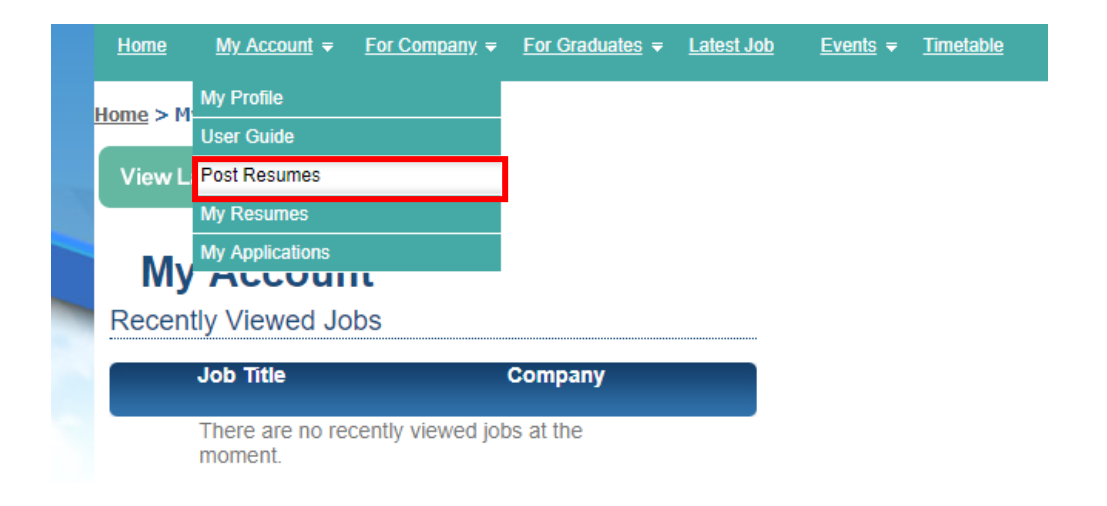
Step 3: Upload resume and portfolio. Press submit button at the bottom after completed